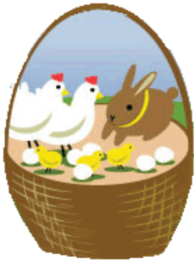
Heifer Basket of Hope